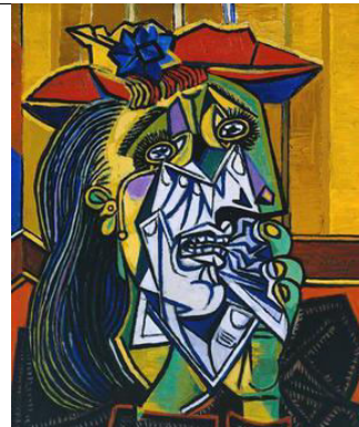
The Weeping Woman (1937)