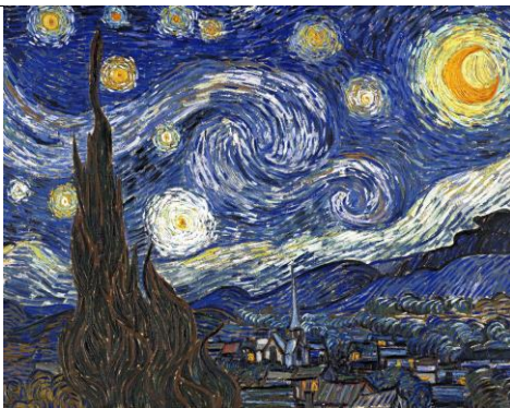
A Starry Night (1889)