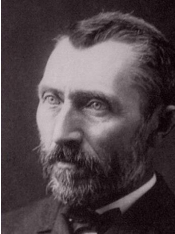
Vincent Van Gogh 1853-1890